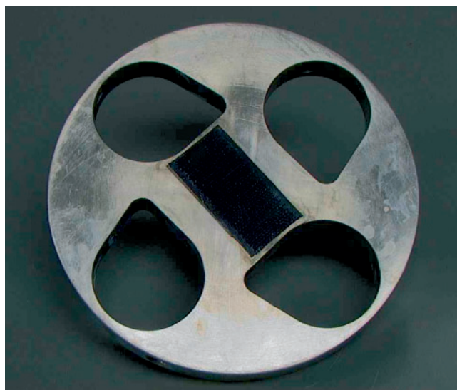
The "hook and loop" tape can be used on standard specimen holders

The hook and loop tape provides a strong but flexible joint between specimen and sample holder which allows the surface of the speci-