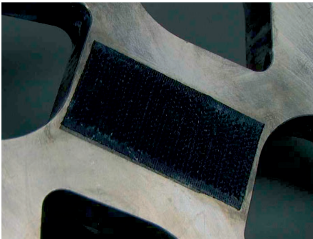
The "hook" part of the tape is applied to the specimen holder for best results.

I have also tried double sided sticky foam pads, but these I found very difficult to remove and in-process cleaning and rinsing was unsatisfactory. Double sided sticky tape, not the foam type, was also unsatisfactory unless the sample was almost parallel to start with but again, difficult to remove residues of tape and adhesive.